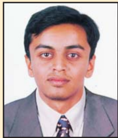
2009-03-B Poshiya S. C.