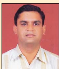
2004-08-B/M Pipalia B. H.