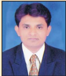
2007-06-M Korat V. P.