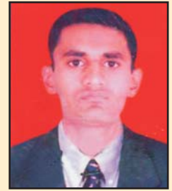
2007-05-M Babariya N. D.