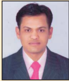
2008-10-B Ghadiya C. D.