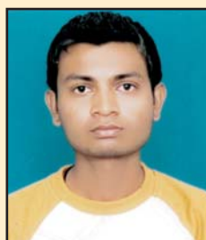
2012-12-M Mithapara D. E.