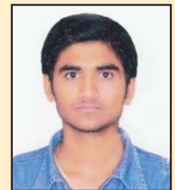
2011-11-B Vasoya U. J.