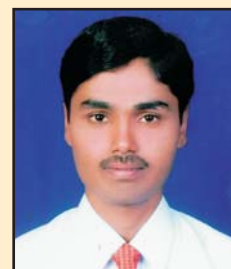
2012-10-M Karad G. U.