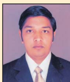
2012-21-M Dhangar U. D.