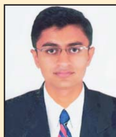
2011-17-B Patoliya J. U.