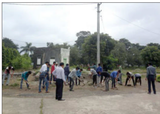
Celebration of Mahatma Gandhi Jayanti with Shramdaan