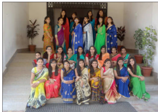
Vesh Paridhan by NSS Volunteers