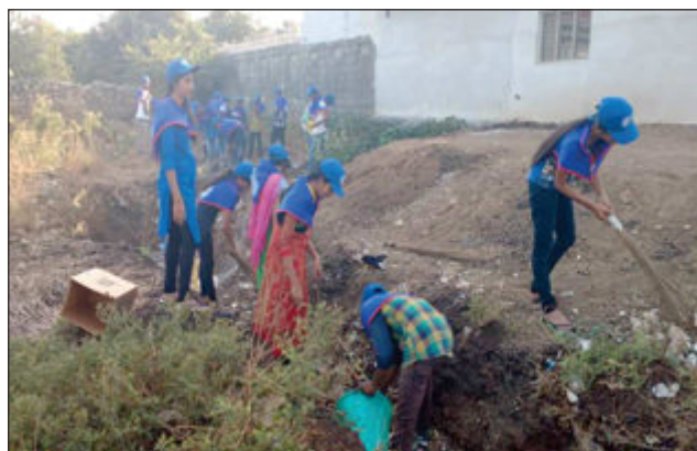
Shramdaan at Special camp site