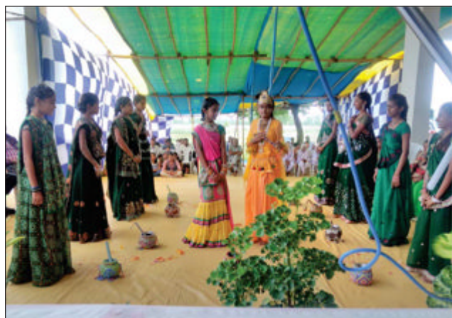
Awareness programme for Woman empowerment