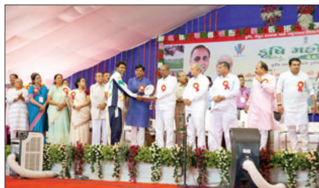
Felicitation to Gold medal winner by Minister