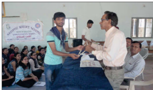
Special camp at Itali