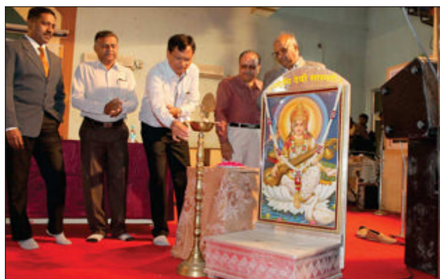
Inauguration of Cultural Competition