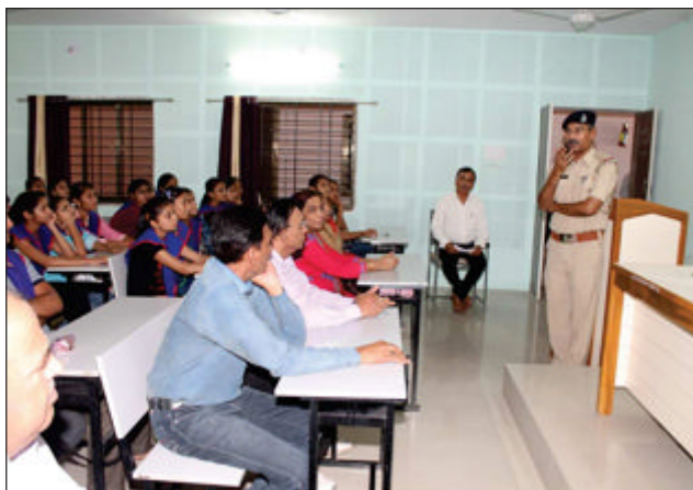
Seminar on Road Safety by RTO, Junagadh