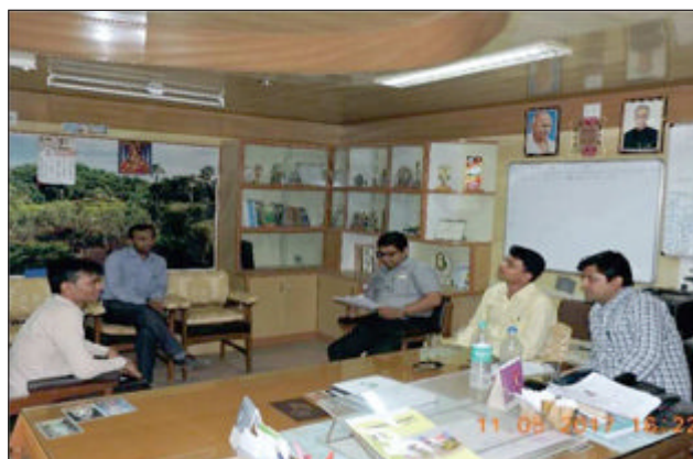
Campus Interview by Captain Tractors at College of AgrilEngg. & Technology, Junagadh