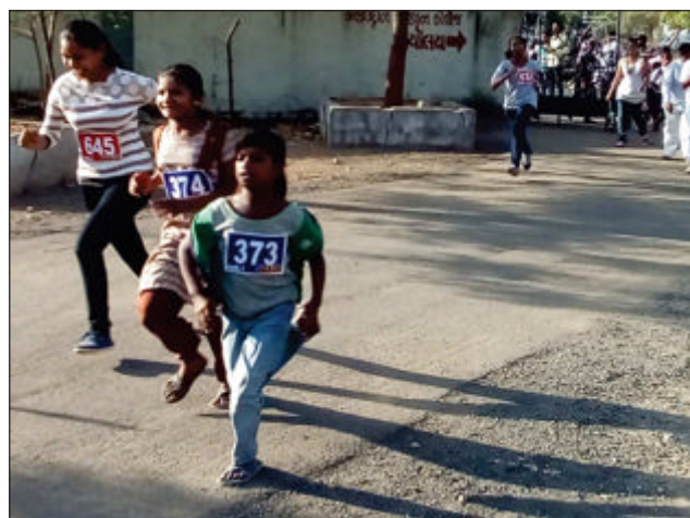
Run for Gujarat