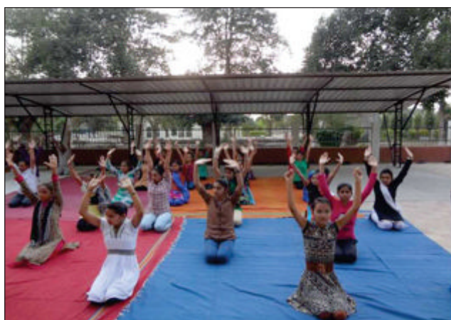
One day Yoga shibir