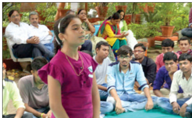
Activity of one day camp-Debate