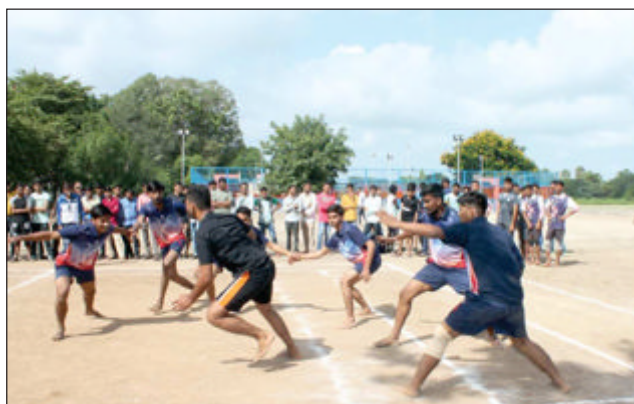
Inter Collegiate Kabaddi Tournament