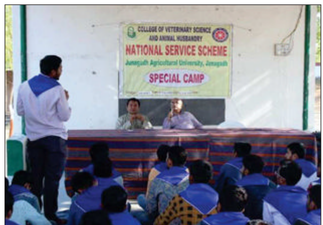
Skill development programme