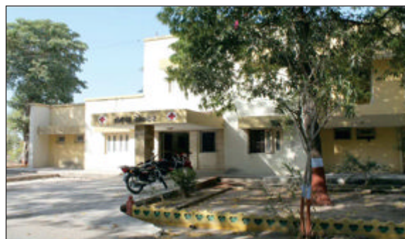
University Health Centre