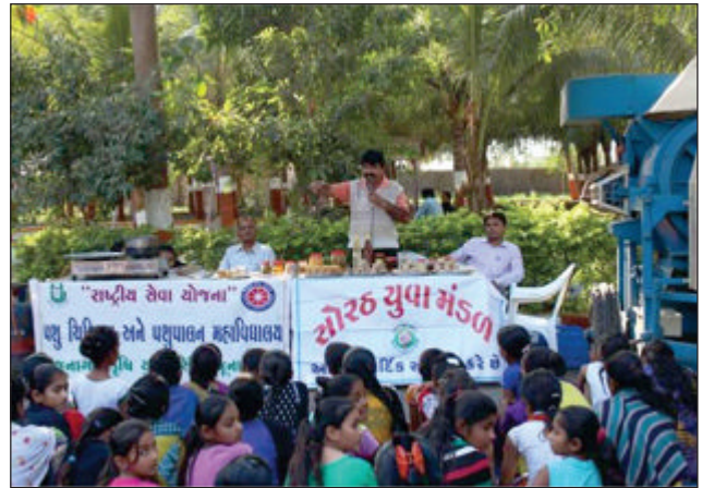
Home Science Demonstration