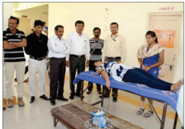
Blood donation camp