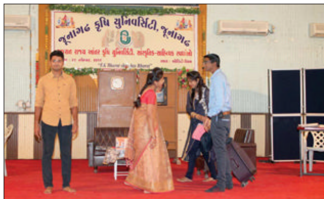
Inter Agril. Uni. Cultural Competition