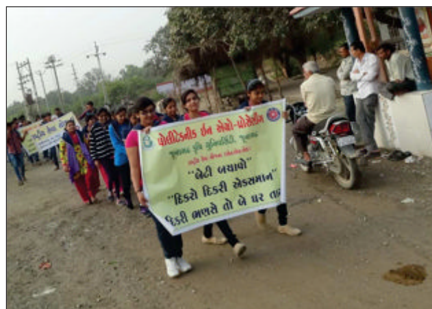
Rally for Save Girl Child