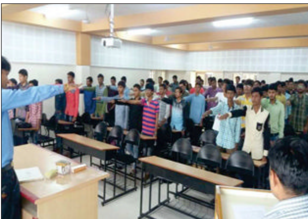
Vigilance awareness Programme