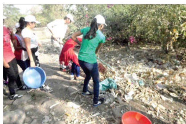
Cleaning work under Swachchata Abhiyan