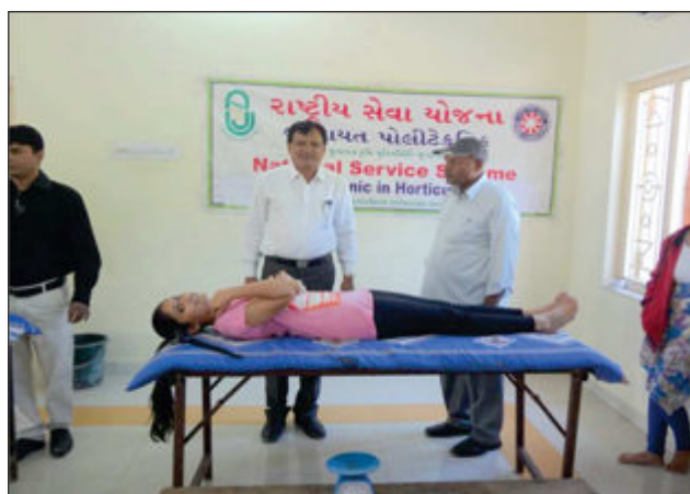
Blood donation camp