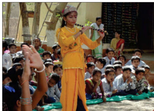
Cultural Programme on social awareness