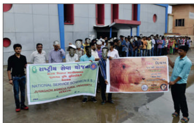
Celebration of World Lion Day