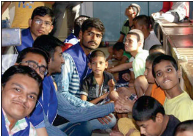
Interaction with Physically challenged child