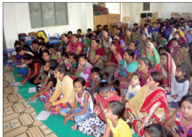
Programme on Health awareness