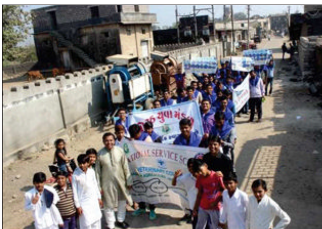
Energy Conservation Awareness Rally