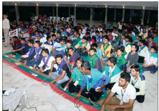
Participation in State Level Cultural Programme