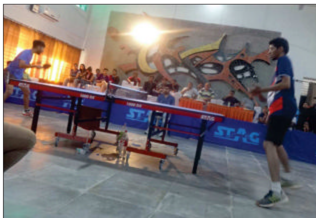
All India Inter Agricultural University Participation