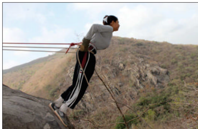
Basic rock climbing camp