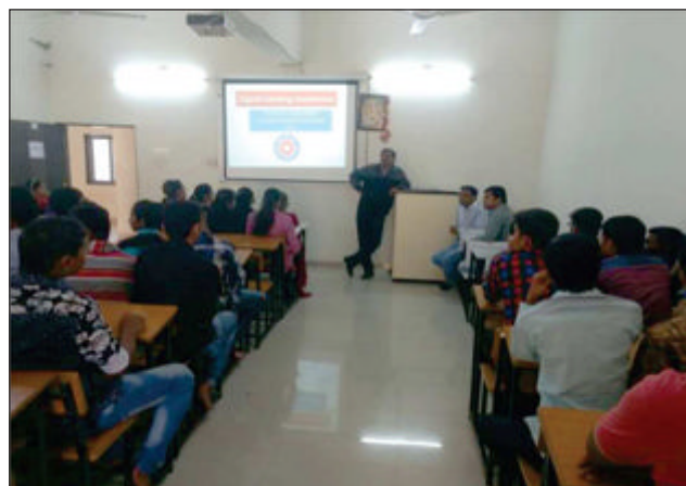
Awareness Programme for Digital Banking