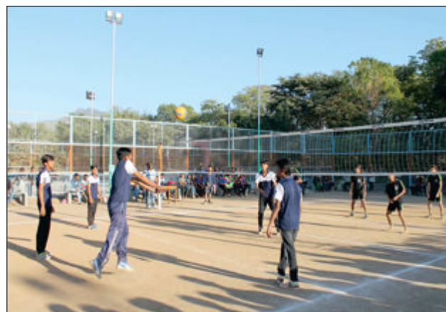
Inter Polytechnic Volleyball competition