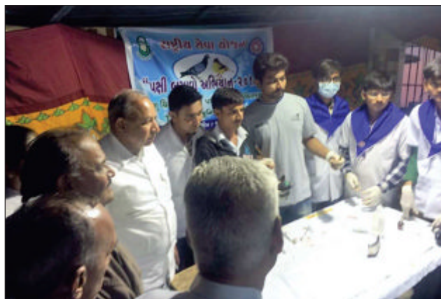
Participation in Bharatiya Chhatra Sansad at Pune