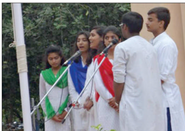
Celebration of Independence Day