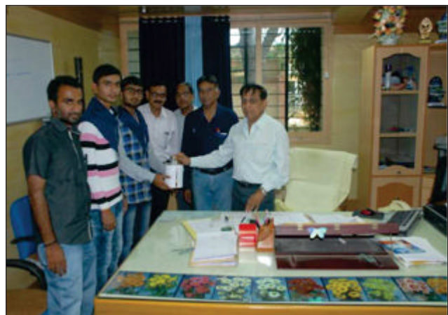
National Flag day Collection of fund