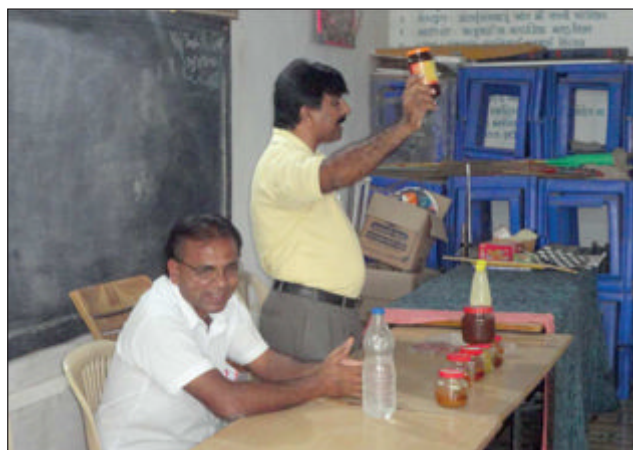
Demonstration on Home Science