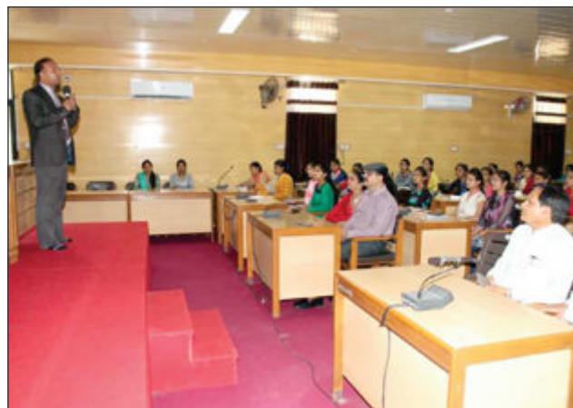
One day C2C Programme