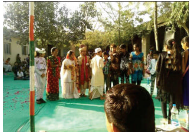
Cultural Program on Jago Grahak Jago