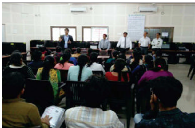
Campus Interview by ICICI Bank at College of Agriculture, Junagadh