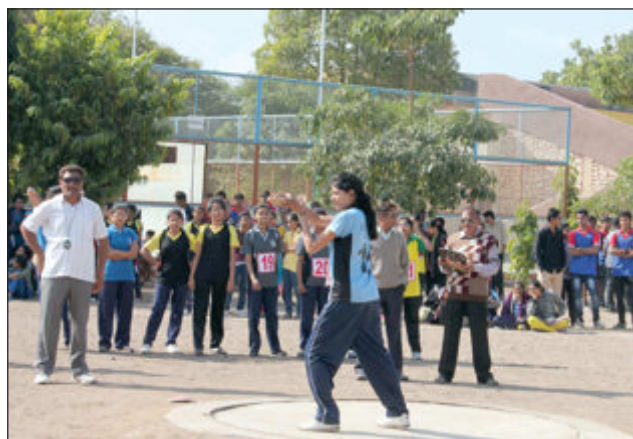
Inter Polytechnic Discus Throw competition