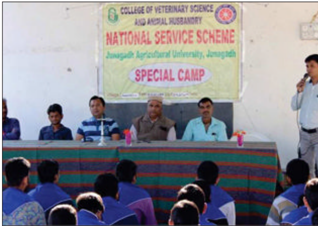
Inauguration of NSS Special camp