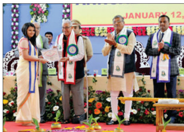
Medals Awarded in the 12 th Convocation of JAU