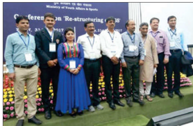
Participation in National Conference, New Delhi