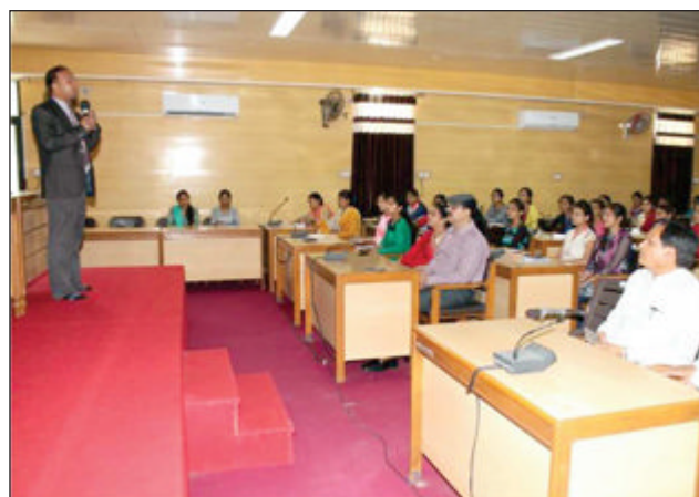
One day training on Campus to Corporate