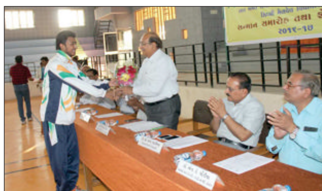
Felicitation of Gold medal winner by Hon'ble Vice Chancellor