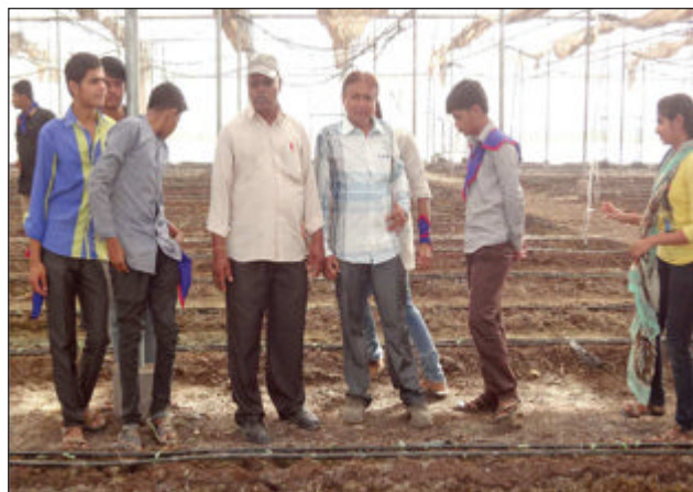
Visit to Farmers field