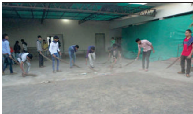
Shramdaan at Itali camp