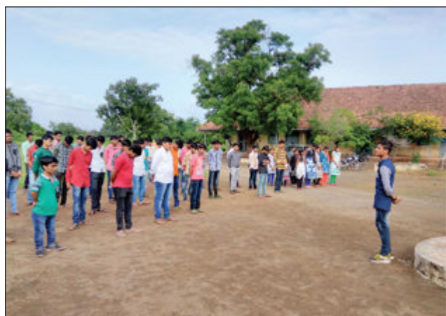
Celebration of Independence Day