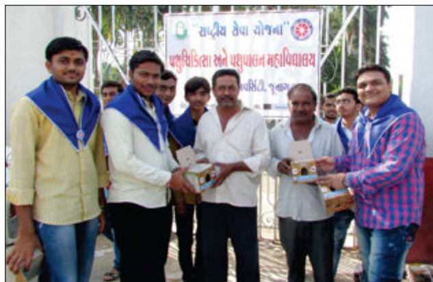
Sparrow Conservation drive