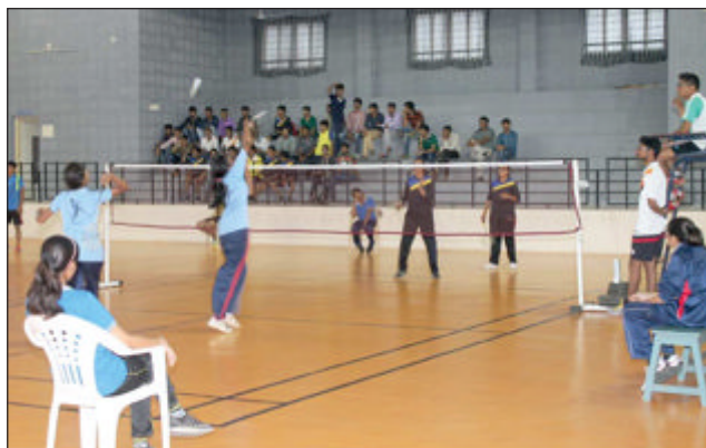
Inter Collegiate Badminton Tournament (Girls)