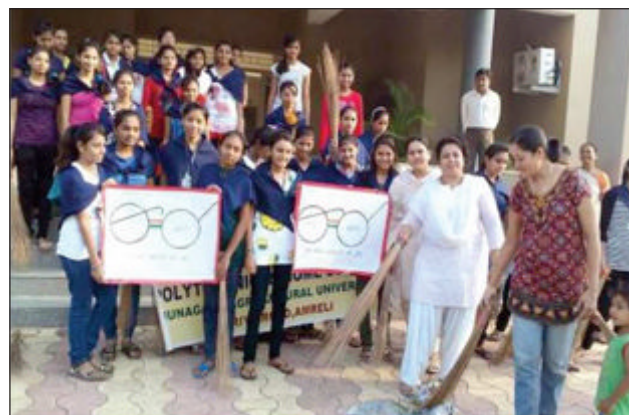
NSS volunteers Taking Pledge of Swachhata movement