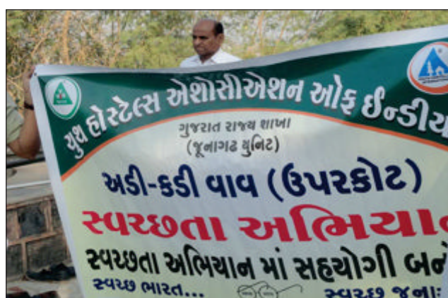
Rally on Swachchata Abhiyan