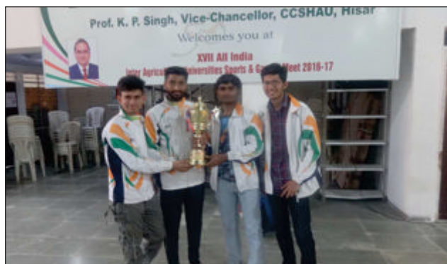
Gold Medal winner Table tennis team of JAU