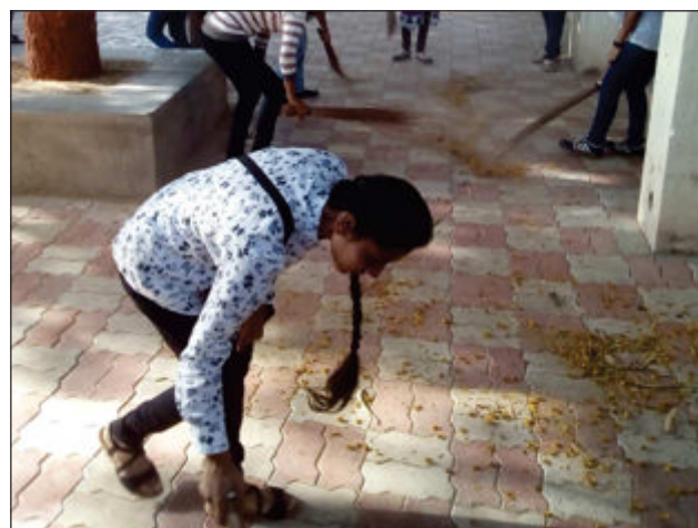
Cleaning work under Swachh Bharat Mission