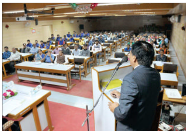
Training on Personality Development by NCCSD, Ahmedabad