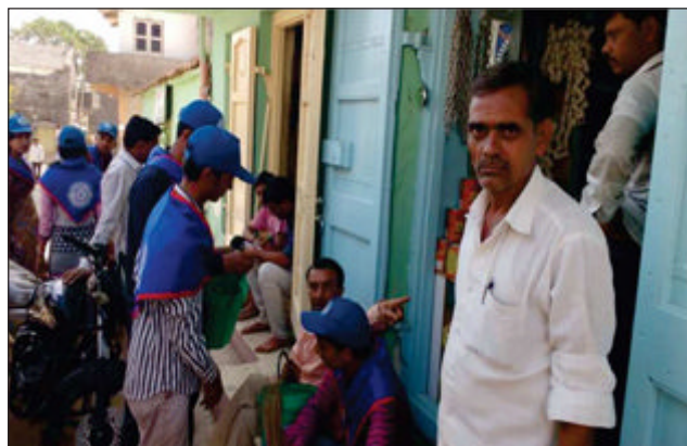
Dust Bin distribution