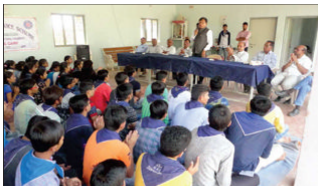
Inauguration of Special camp at Itali