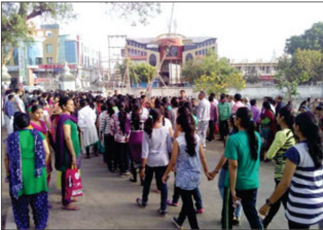
Run for Gujarat