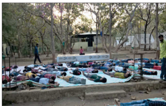
Yoga at Special camp