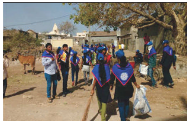
Village Cleaning by NSS Volunteers