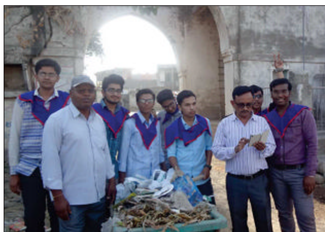
Cleaning activities at camp site