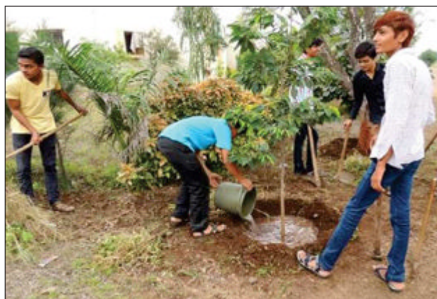
Tree plantation by NSS Volunteers