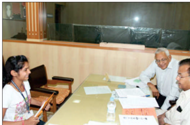
Campus Interview by Jain Irrigation at Polytechnic in Horticulture, Junagadh