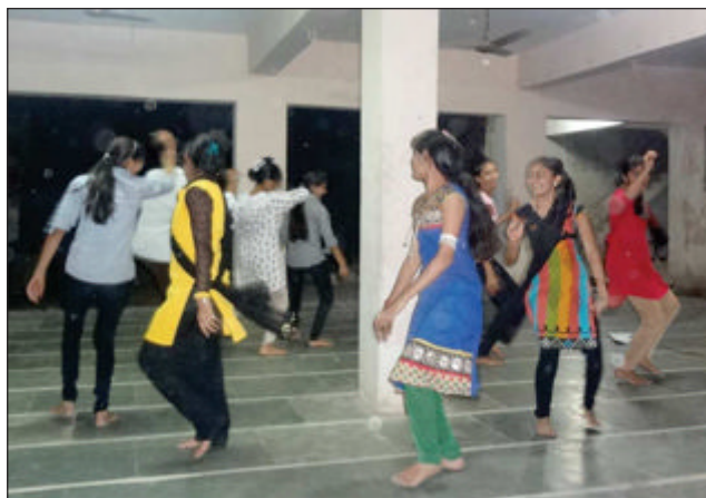
Cultural Programme by NSS Volunteers