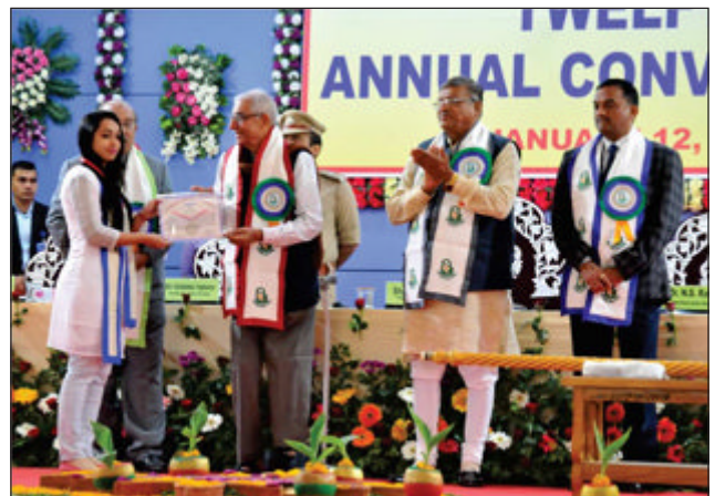
Medals Awarded in the 12 th Convocation of JAU