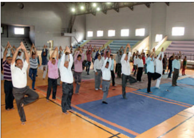
International Yoga day