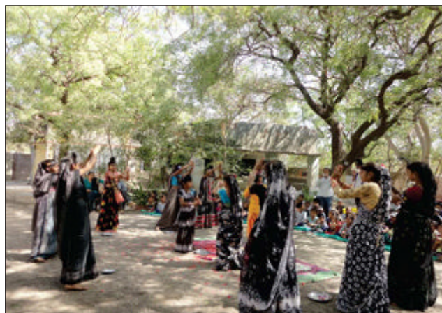
Cultural Programme by NSS Volunteers