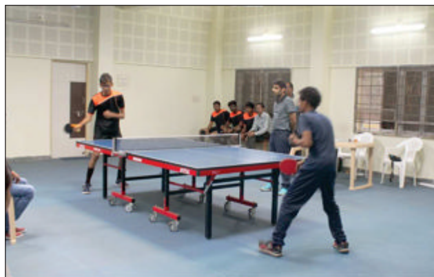
Inter Collegiate Table tennis Tournament