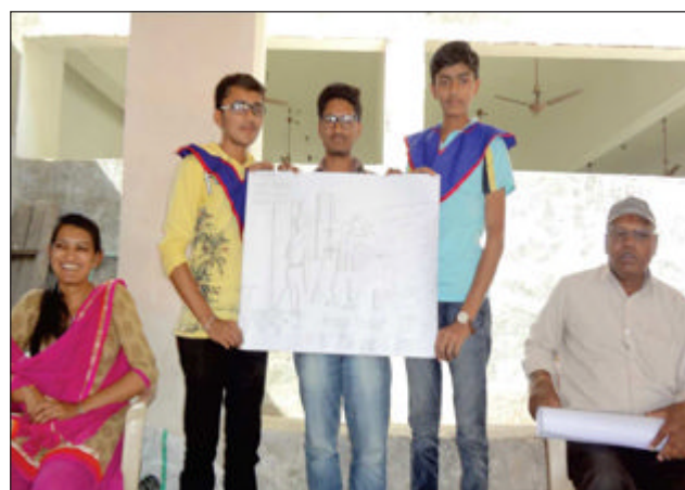
Programme on Environment awareness