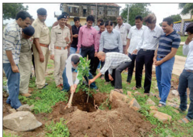
Celebration of Van Mahotsav