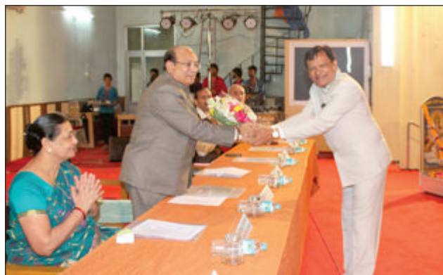
Inauguration of Inter Agril. Uni. Cultural Competition