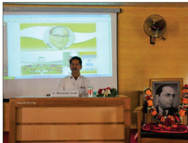
Special lecture on Constitution Day