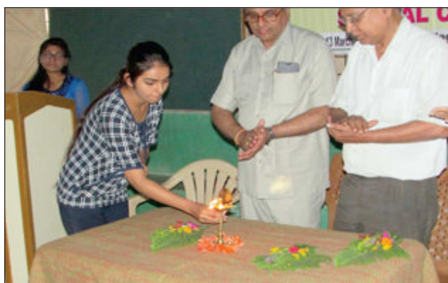
Inauguration of special camp