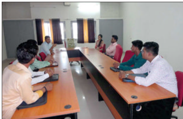
Campus Interview by Mahindra group at Polytechnic in Agriculture, Dhari