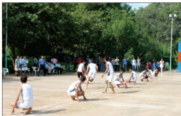
Inter Collegiate Kho-kho Tournament