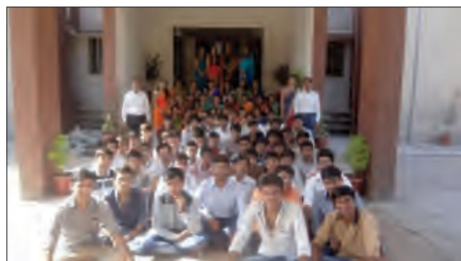
Vesh Paridhan Dt.11/04/2017