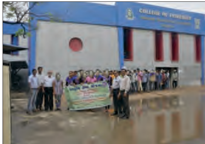
World Lion Day Celebration Dt.10/08/2017