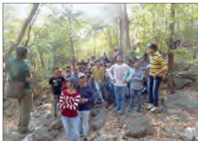
NSS Special Camp at Khadiya Dt.10 to 16/02/2018