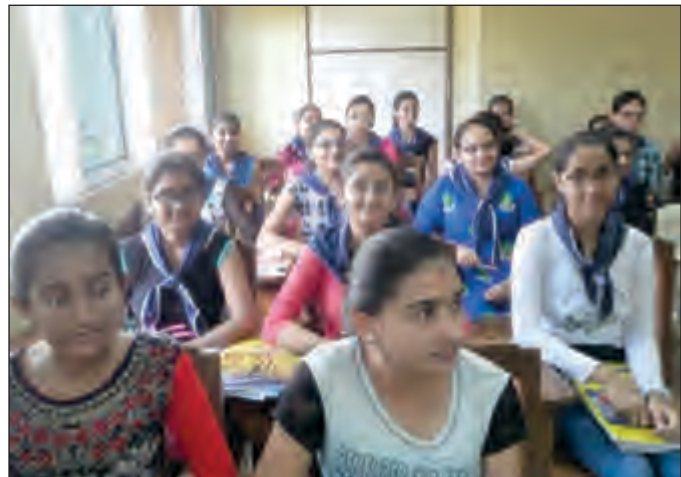
International Suicide Day Celebration Dt.14/09/2017