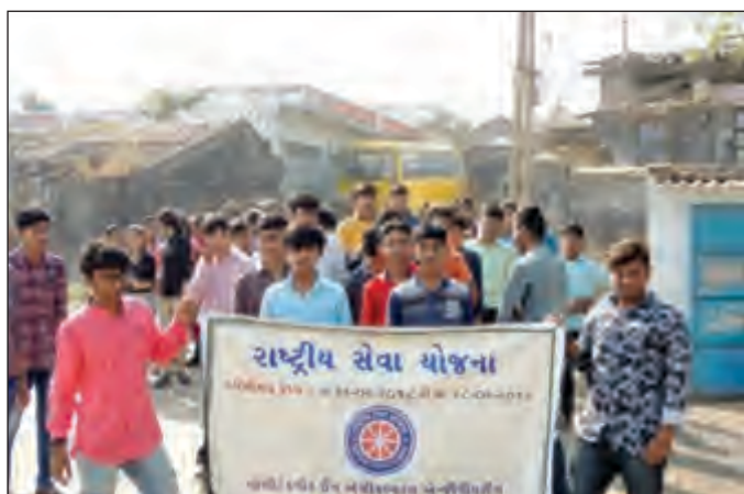
NSS Special Camp at Kothariya Dt.22 to 28/02/2018