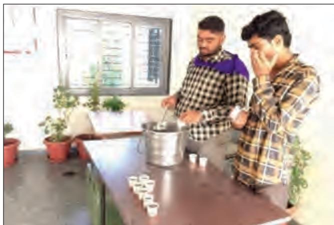
Distribution of Ayurvedic extract against Swine Flu Dt.28/07/2017