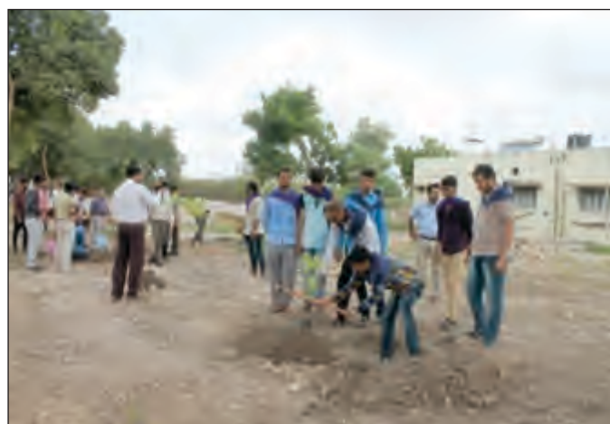
Tree Plantation Dt.05/06/2017