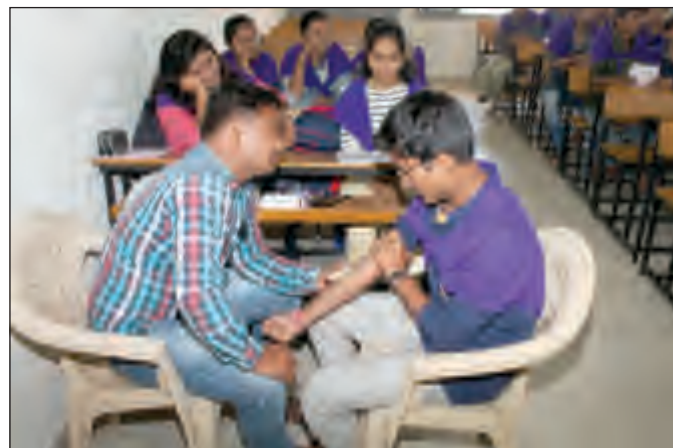
Thalassemia Camp at Polytechnic in Agriculture, Dhari Dt.08/11/2017