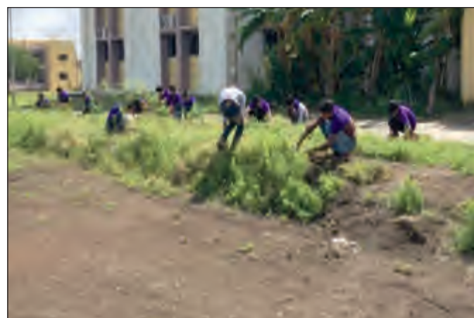
Swachhta Pakhwada Dt.03/09/2017