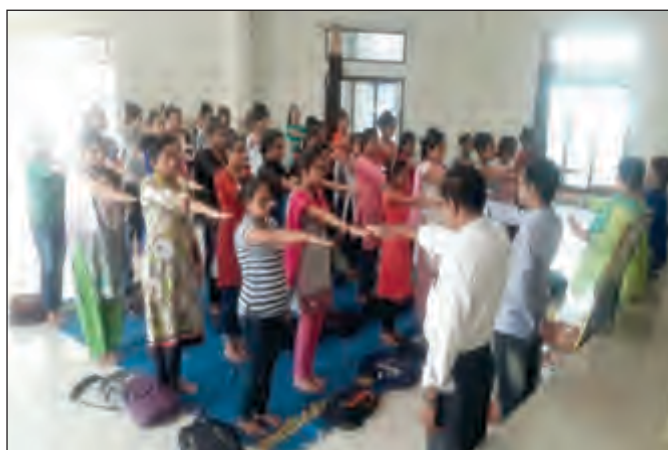
Cleaning activity and Oath under Swachhta Abhiyan Dt.06/09/2017