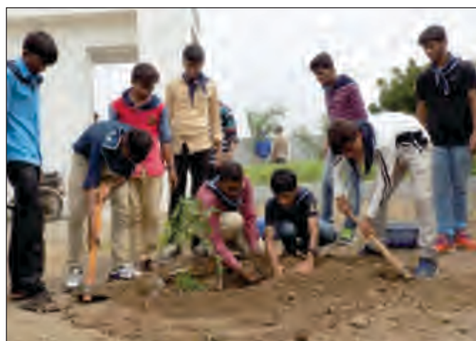
Tree Plantation Dt.05/08/2017