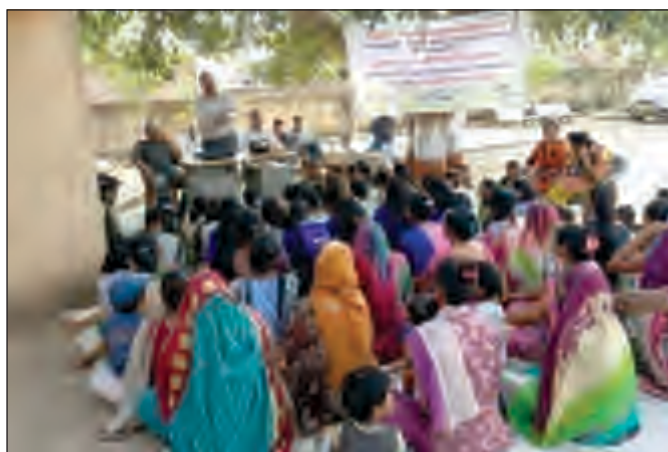
NSS Special Camp at Sukhpur Dt.24/02/2018 to 02/03/2018