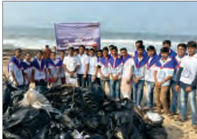
International Coastal Clean Dt.16/09/2017