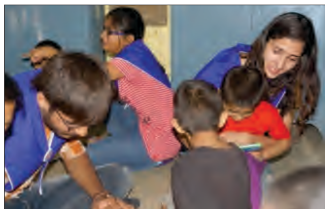
NSS Special Camp at Khadiya Dt.04 to 10/02/2018