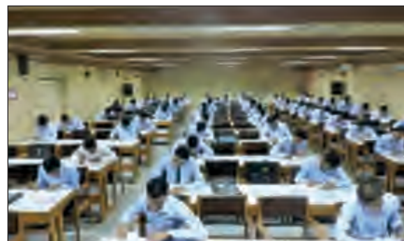
Campus Interview by Agro - Industry