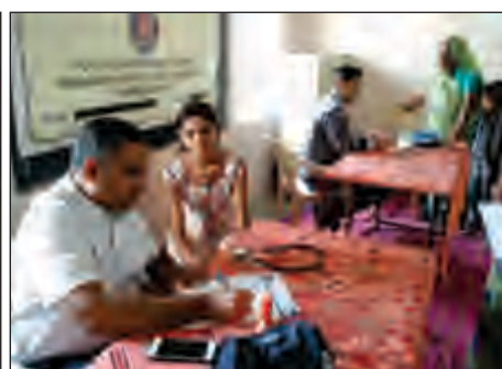
NSS Special Camp at Antaliya Dt.05 to 13/01/2018