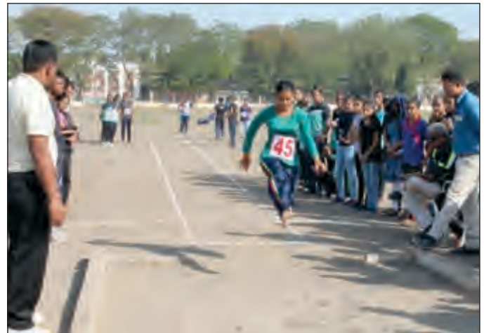
Inter Collegiate Sports Tournament.