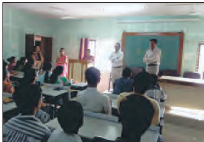
Teachers Day Celebration Dt.12/09/2017