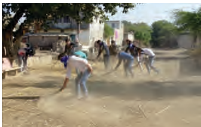
NSS Special camp at Mota Bhandariya (Amreli)