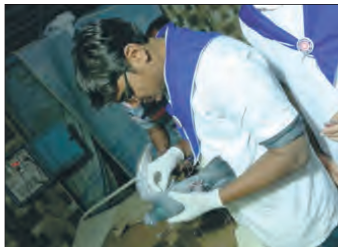
Save Bird campaign Dt.14/01/2018