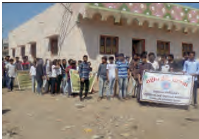
NSS Special Camp at Mota Kajaliyala Dt.05 to 11/03/2018