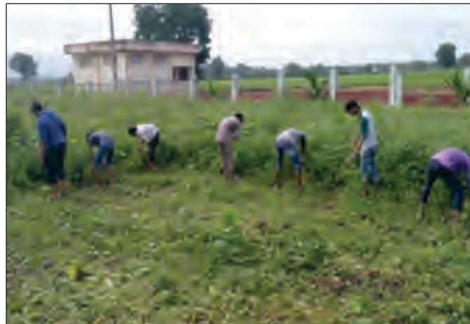
Swachhta Pakhwada Dt.27/10/2017