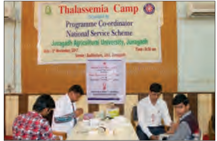
Thalassemia Camp at Junagadh Dt.08-09/11/2017