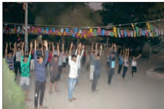
NSS Special Camp at Mota kajaliyala Dt.05 to 11/03/2018