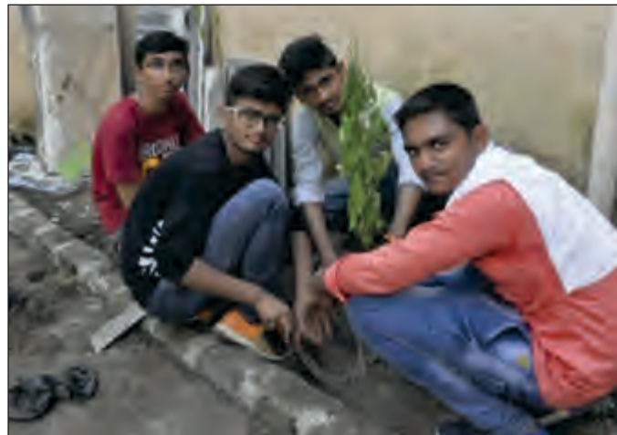
Tree Plantation Dt.16/09/2017