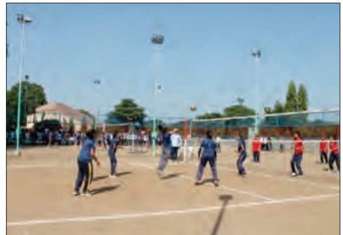
Inter Collegiate Sports Tournament.