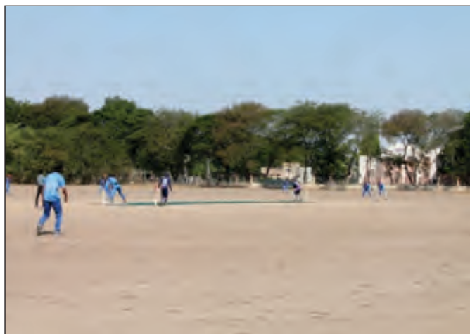
Inter University Sports Participation.