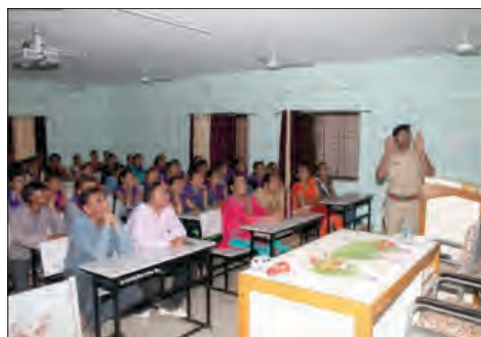
Awarness Programme on Road Safety Dt.21/04/2017