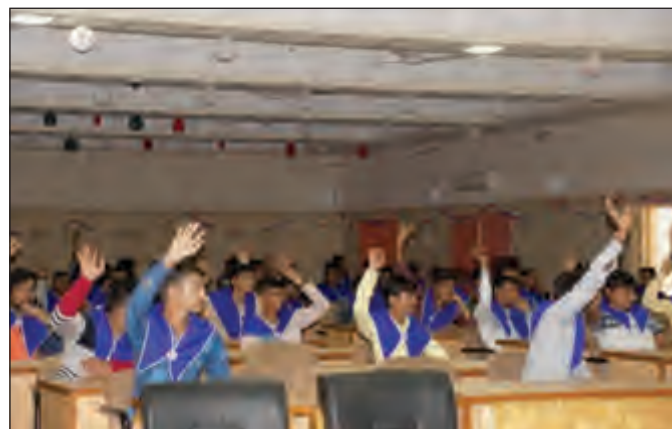
National Unity Day Celebration Dt.31/10/2017