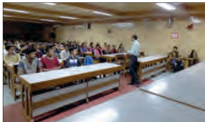
Health Awareness Dt.12/10/2017