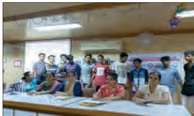
Celebration of Green Day Dt.14/08/2017