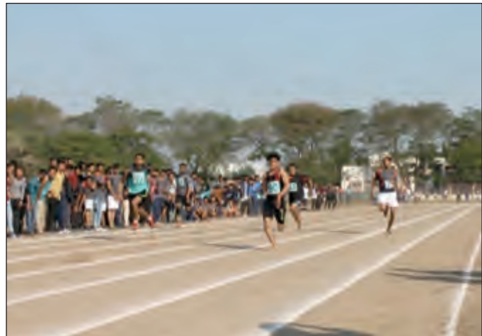
Inter Collegiate Sports Tournament.