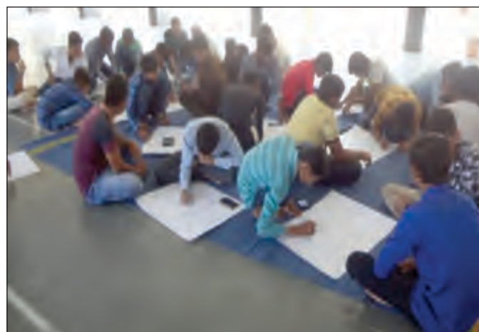
NSS Special Camp at Japodad Dt.17 to 23/03/2018