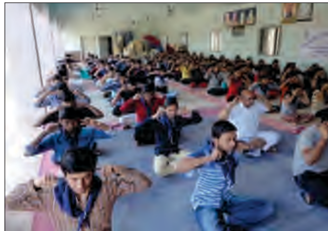
NSS Special Camp at Itali Dt. 05 to 11/03/2018