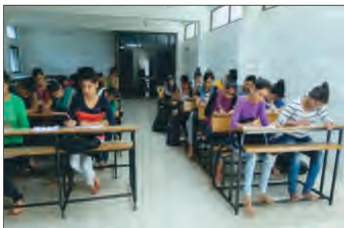
Essay competition under Swachhta Abhiyan Dt.06/09/2017