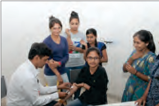
Thalassemia Camp at Polytechnic in Home Science, Amreli Dt.08/11/2017