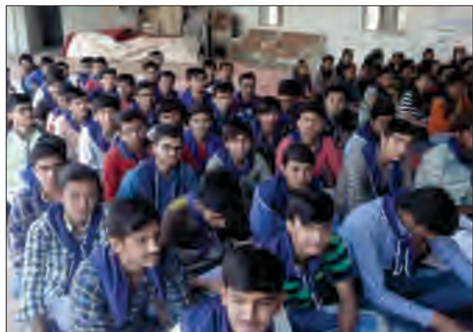
Road Safety Dt.10-11/04/2017