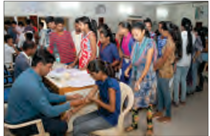
Thalassemia Camp at College of Fisheries, Veraval Dt.09/11/2017