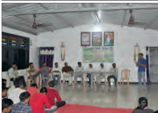
NSS Special Camp at Dhava (Gir) Dt.12 to 18/03/2018