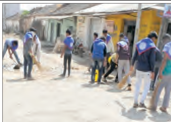
NSS Special Camp at Dhava (Gir) Dt.12 to 18/03/2018