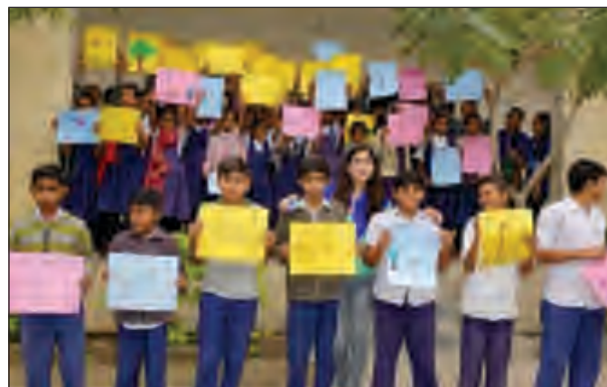
NSS Special Camp at Khadiya Dt.04 to 10/02/2018