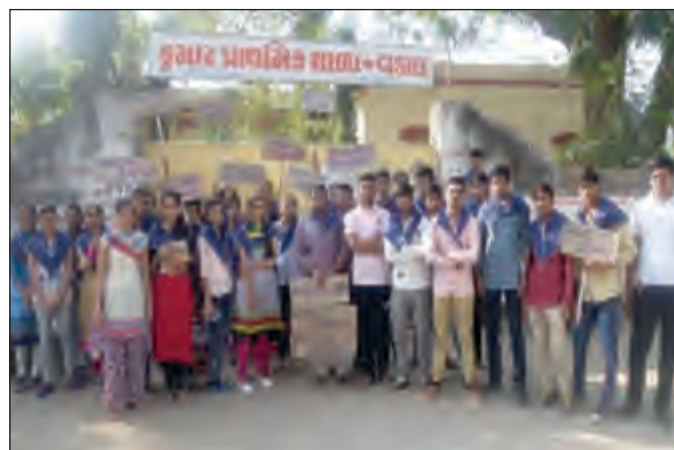
NSS Special Camp at Vadal Dt.22 to 28/02/2018