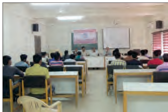
Agriculture Education Day Dt.03/12/2017